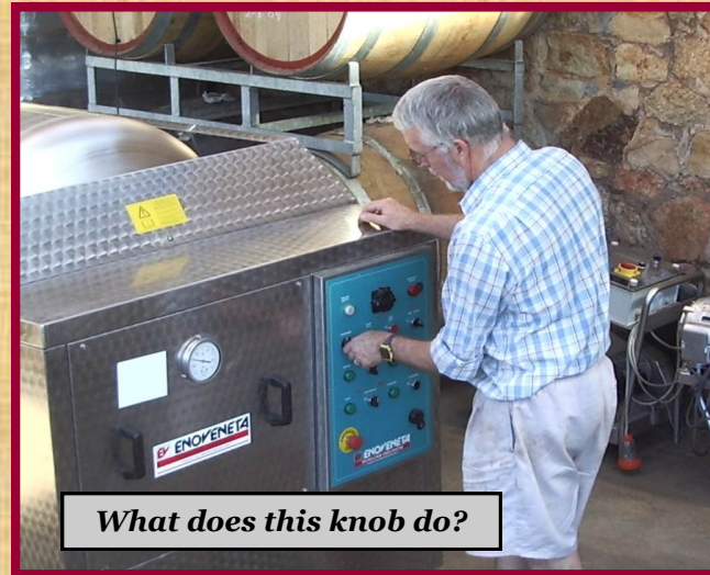
What does this knob do?

The new winemaking equipment was finally given a good work out. A loose wire in the electronics of the new air bag press caused some momentary consternation but a clever electrician soon put it right. The machine is wonderful. It is fairly automatic and saves a lot of time for us. I still watch it like a hawk and taste the product coming out all the time to ensure it is doing the job right—you can never fully trust these machines. I'm not sure yet if the final wines will be different or better than the old basket press—initial assessments seem to indicate they will be better. A little bit